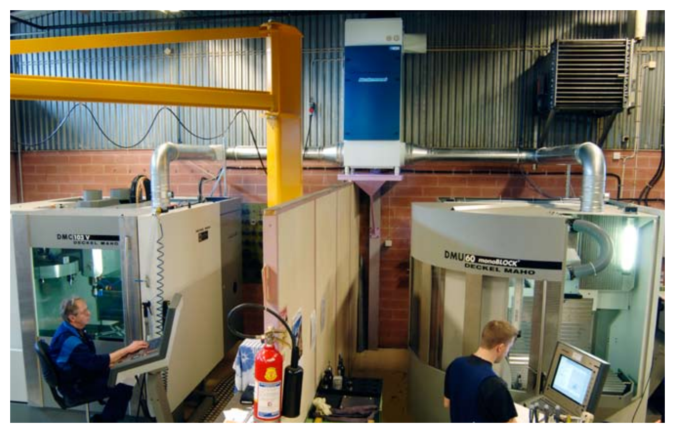
By removing oil mist at source it will be prevented from settling on sensitive electronics or other surfaces in the workshop, disrupting production and creating hazards.